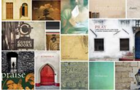
4. Textured / Old World