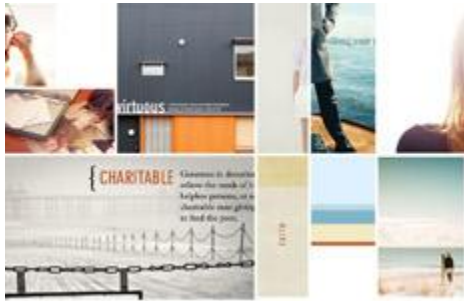
6. Modern / Cool / Open

16. Are there other websites whose design/look you like (if possible include websites for organizations that are different and similar to your organization/company)?