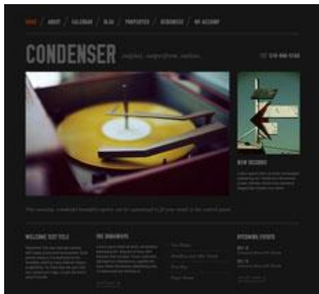
7. Rock and Roll