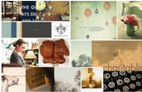
5. Simple / Clean