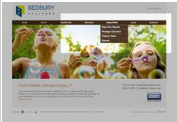
Drop Down Menu

12. What elements do you think you may want on your home page?